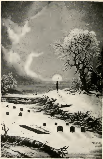
“ALL QUIET ALONG THE POTOMAC”